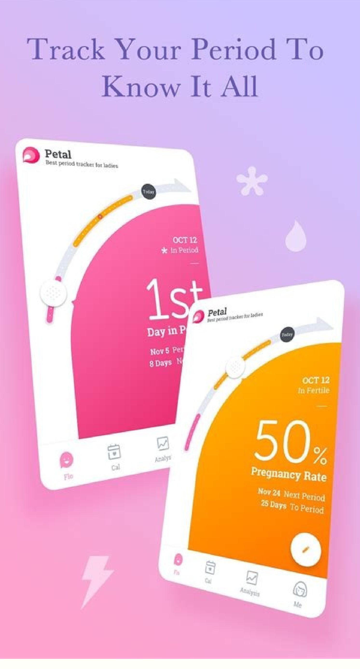
Best ovulation calendar android. Best free ovulation app 2020. What is the best app for ovulation calendar app for android. Is the ovulation calendar accurate. Free download ovulation calendar for android. Does the ovulation calendar really work