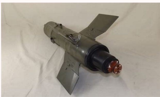
Russian wire guided anti tank missile.